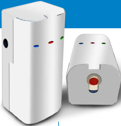
UNION SMOKE BASIC