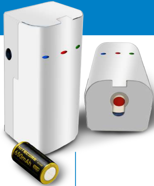
UNION SMOKE BATTERY